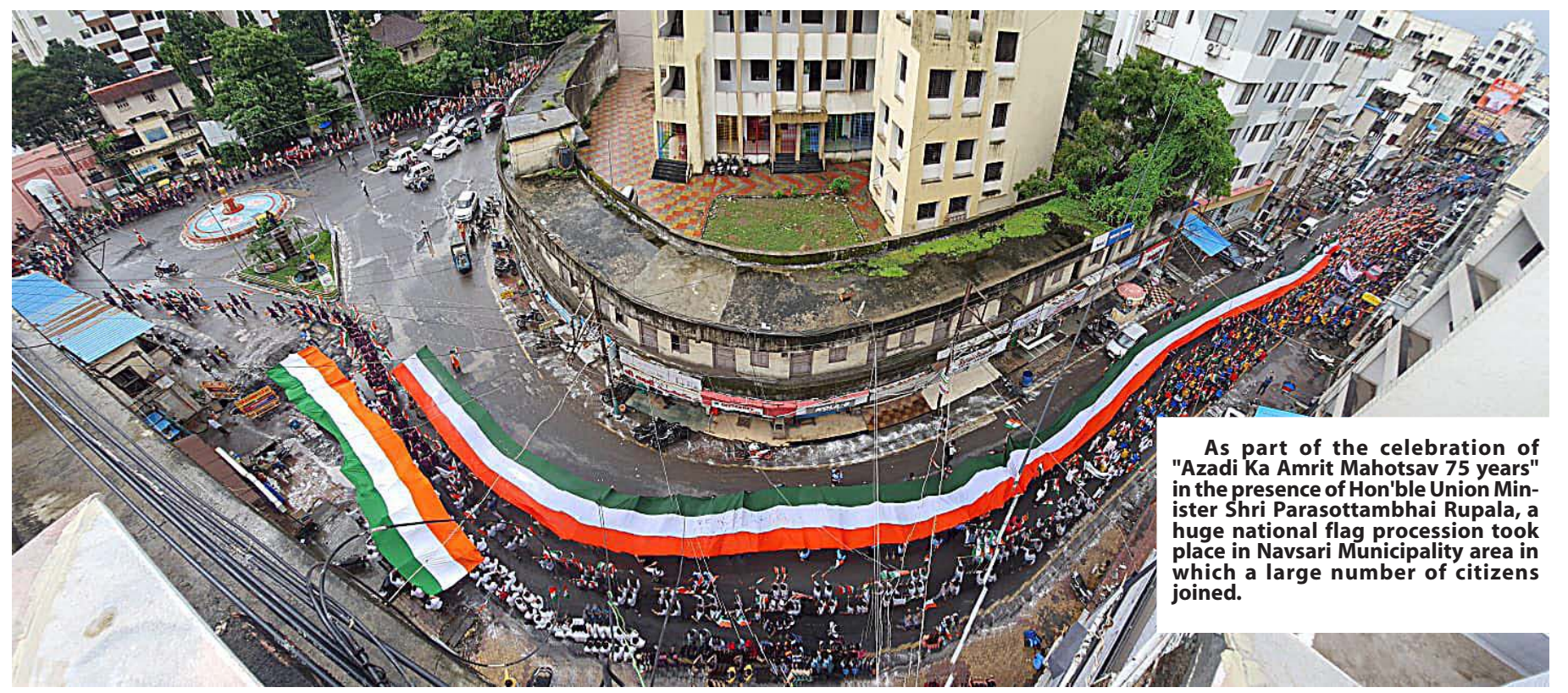
As part of the celebration of "Azadi Ka Amrit Mahotsav 75 years" in the presence of Hon'ble Union Minister Shri Parasottambhai Rupala, a huge national flag procession took place in Navsari Municipality area in which a large number of citizens joined.

Considering the then economic environment, and the considerable uncertainty that the pandemic had injected in the aviation sector, some airlines did in fact support the imposition of these pricing restrictions. But by intervening in the functioning of the market, by making commercial decisions which should be the prerogative of airlines, these price caps ended up distorting the market, having unintended consequences on both demand and supply. While various justifications have been marshalled in favour of the imposition of this policy during the pandemic, the reality is that price restrictions by the government are the norm, not the exception. Across a range of sectors, ranging from urea to medical devices, price restrictions are prevalent, despite their well-known economic consequences.