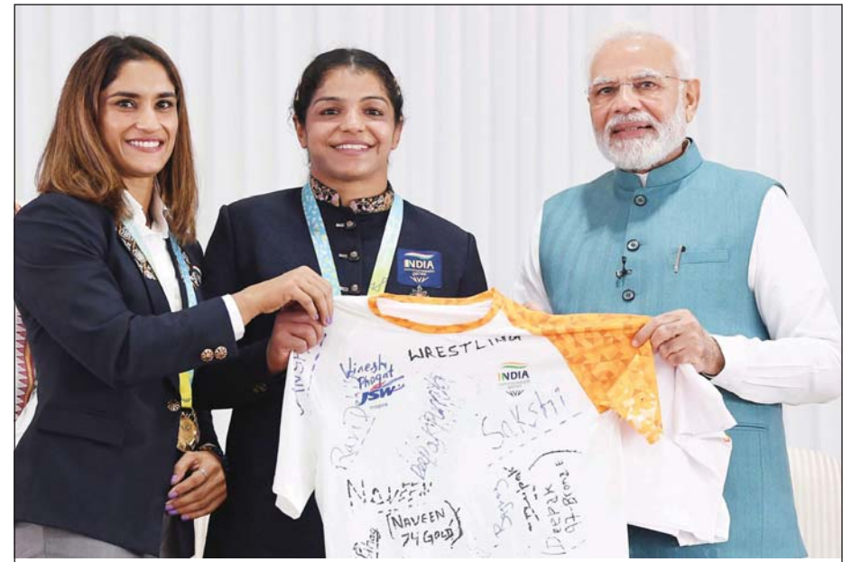
Prime Minister Narendra Modi felicitates Indian Contingent for Commonwealth Games 2022, in New Delhi on Saturday.

"We have witnessed the power of tricolor in Ukraine some time ago. The tricolor had become a protective shield not only for Indians but also for people from other countries in getting out of the battlefield," he said. Modi asked the players to go to the schools and give them inspiration to do well in life.