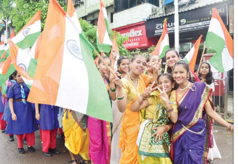
Students participating at Tiranga Rally as part of Azadi Ka Amrit Mahotsav celebrations to commemorate the 75th anniversary of India's independence in Mumbai on Saturday.

ing agency has added that the accused in the case might be having an international link. The NIA had earlier conducted searches at 13 locations in Maharashtra, which led them to the recovery of incriminating documents. During the searches conducted at the premises of the accused and suspects, digital devices (mobile phones, SIM cards, memory cards, DVRs), pamphlets spreading hate messages, knives, and other incriminating documents and materials were seized. The case was initially registered with Kotwali police station on June 22 and later on the probe was taken over by the NIA on July 2.