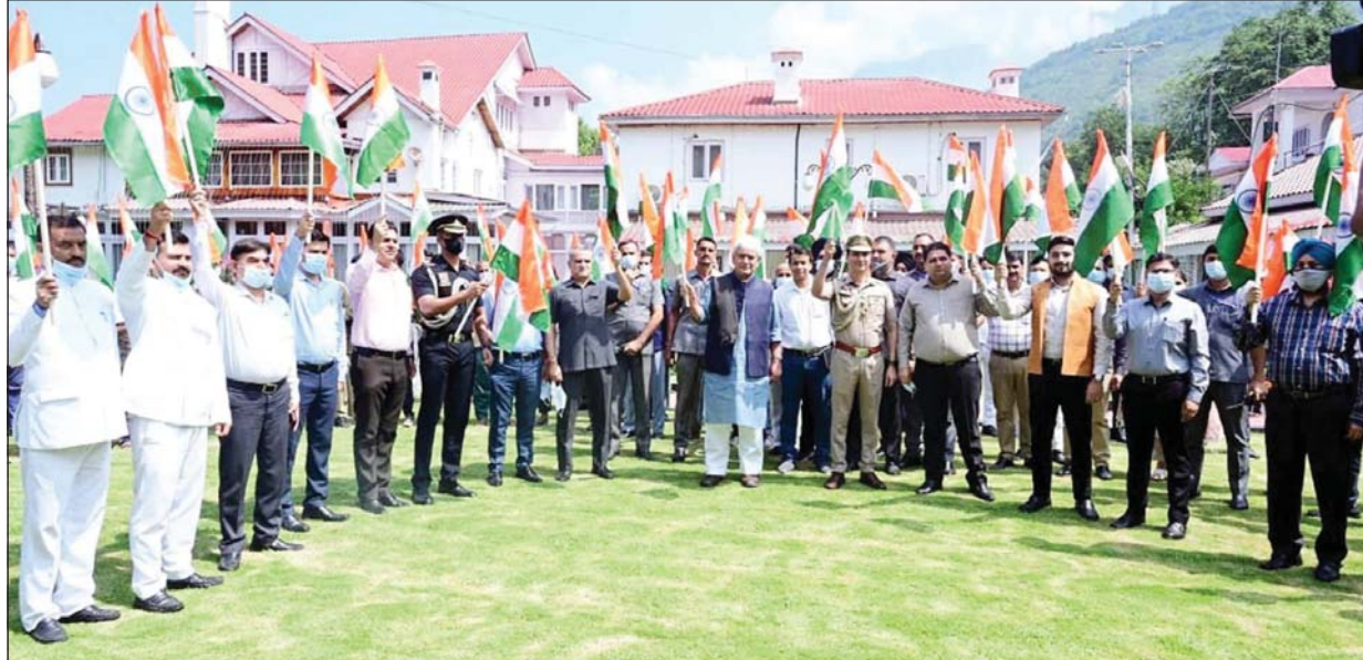
Jammu and Kashmir Lt Governor Manoj Sinha along with Raj Bhawan staff holding national flag during Har Ghar Tiranga campaign, in Srinagar on Saturday.

New Delhi, Aug 13 (IANS) Rashtriya Swayamsevak Sangh chief Mohan Bhagwat, Sangh leaders and RSS have removed the display picture of their official social media accounts and replaced it with Tricolour. The RSS on Saturday shared a 48 second video on its official Twitter account in which Bhagwat and other Sangh officials can be seen hoisting Tricolour on different occasions. On the occasion of 75th anniversary of the Independence, Prime Minister Narendra Modi had appealed to all countrymen to change their DP on social media and put Tricolour on it. In line with the Prime Minister's 'Har Ghar Tiranga' campaign, the RSS has also urged the people to awaken self-respect and tweeted, "Celebrate the Azadi Ka Amrit Mahotsav. Hoist the Tricolor in every house. Awaken the national self-respect."